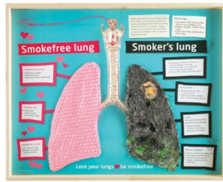
Smoker/Non Smoker Display