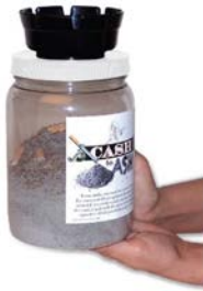
Cash to Ash Display