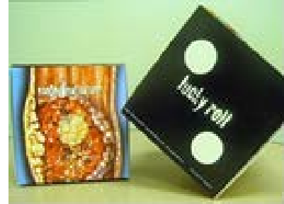
Chewing Tobacco Dice