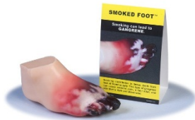
Smoked Foot – Gangrene Model