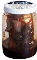
Cause of Death: Secondhand Smoke Display