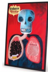
Tobacco Death Display (Marble Display Board)