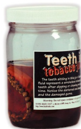
Teeth in Tobacco Juice Display